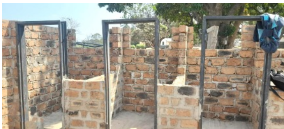
The toilet and shower area of the girls' dormitory is taking shape