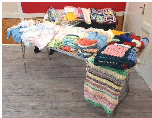
Knitted garments and blankets from Theydon Bois Baptist Church Women Together group

A very big thank you to all who have supported the work throughout the year in some way, whether through prayer, finance, donation of goods or any other way. May God bless you richly for your efforts on behalf of the children. May you have a happy, blessed and peaceful Christmas!